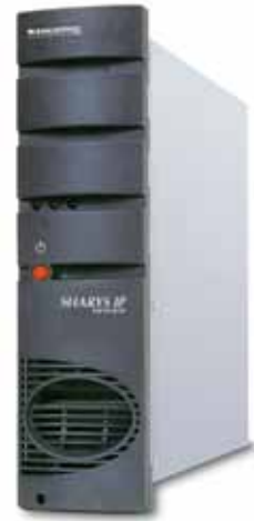
SHARYS 030 A

All SHARYS IP (SH-IP) series rectifiers are certified by TÜV SÜD with regard to product safety (EN 61204-7 and EN 60950-1).