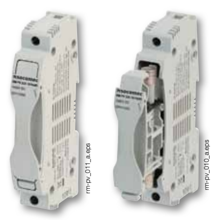
RM PV 10/14 x 85

for 10 x 85 and 10/14 x 85 gPV 1500 VDC fuses